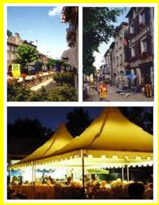
Caylus – shops & lakeside