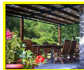
Caylus – shops & lakeside